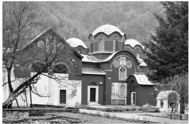
Patriarchal Catholicon at Pech Monastery, Kosovo