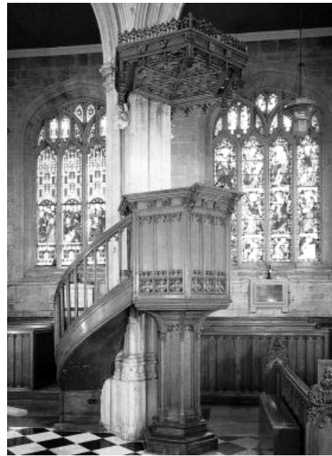
Newman's Pulpit at the Church of Saint Mary the Virgin, Oxford

Now that is odd because Newman insisted always that religion was a matter of the heart. Faith is not unreasonable, he taught, but neither is it to be found by rational analysis. "We obey God primarily," Newman said in one sermon, "because we actually feel His presence in our consciences bidding us obey Him." 2 It was a recurrent theme: the truth of faith's claim on human lives is established by an inner