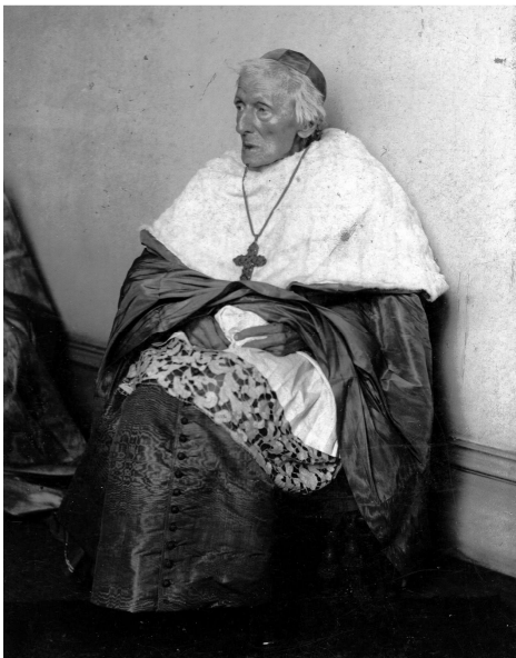
John Henry Cardinal Newman, c. 1889

symbolize and make present the one Lord in whom they participate and who dwells in them: