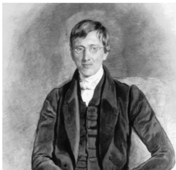
John Henry Newman 1801-1890