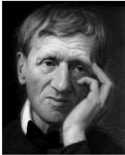
John Henry Newman, c. 1850

clearly distinguishes between faith and devotion: “I fully grant that devotion toward the Blessed Virgin has increased among Catholics with the progress of the centuries; I do not allow that the doctrine concerning her has undergone a growth, for I believe that has been in substance one and the same from the beginning.” 13 Much like Hans Urs von Balthasar would do after him, Newman seeks the fundamental Marian principle, that is, “the prima facie view of her person and office, the broad outline laid down of her, the aspect under which she comes to us, in the writings of the Fathers.” 14 In keeping with his understanding of the development of ideas, and the centrality of the Incarnation, Newman inquires into the basis of all Marian discourse, whether intellectual or affective, in the orders of history and logic: she is the second Eve. 15 For Newman this interpretation seems undeniable on account of the parallel with the Old Testament involved; but its significance rests on the fact that this parallelism is the doctrine of the Fathers, from the earliest of times. “This being established,” Newman posits, “by the position and office of Eve in our fall, we are able to determine the position and office of Mary in our restoration.” 16