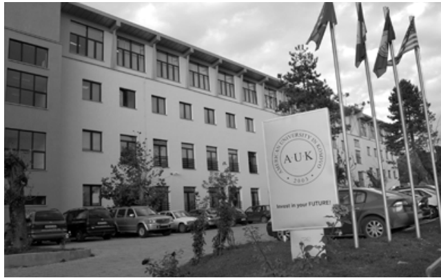
The American University in Kosovo